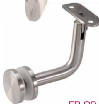
EB 02 Elbow Connector to Glass